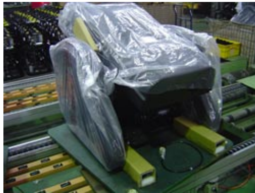
Wrap the chair in the provided plastic wrap, around the back, arms and footrest. Place the chair in the box as shown.