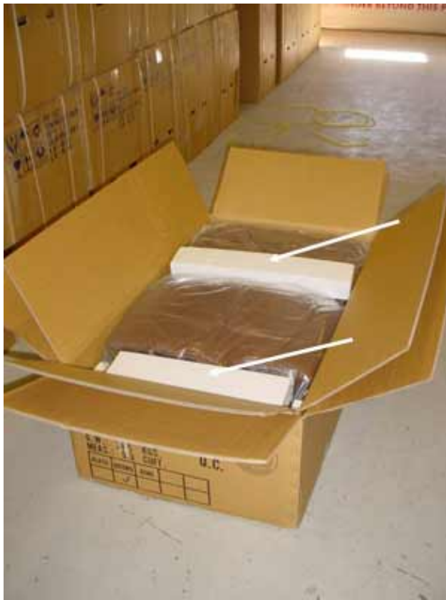
Place the two foam blocks as shown.