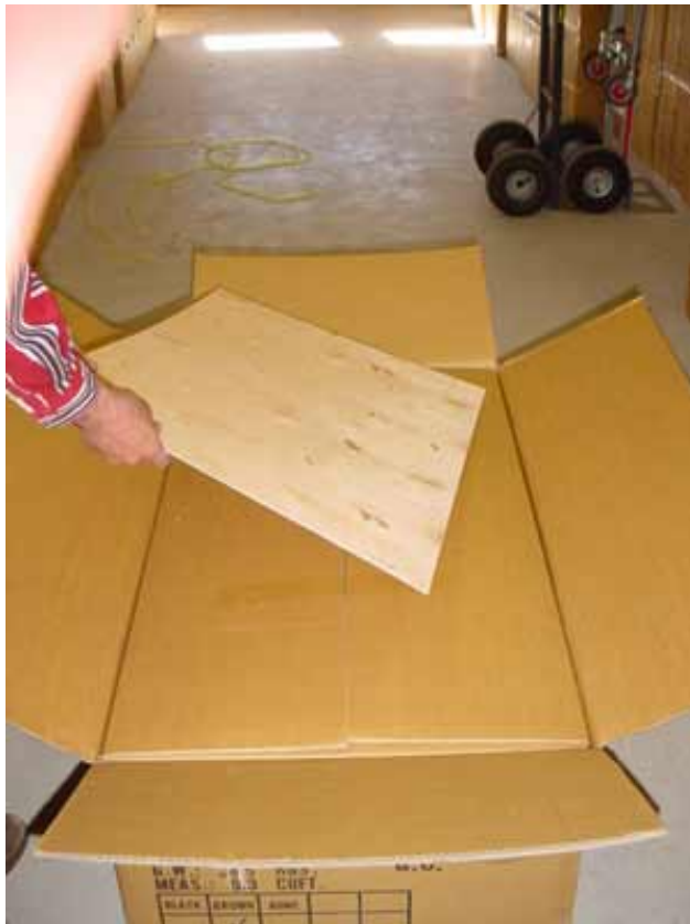
Seal the flaps on the inner box, then place the other piece of flat cardboard or plywood on top and